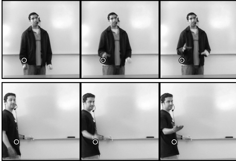
Figure 1: The two rows show examples of interest points that were clustered together by our model; both show the hand moving up out of rest position against a dark background. The center column shows the frame in which the interest point is detected; the left and right columns are 5 frames (166 milliseconds) before and after, respectively.

points, each defined by a real-valued tuple. Each interest point is assumed to be generated from a mixture model. Interest points that are generated by the same mixture component should be visually similar. These components serve as cluster centers and are called gestural “codewords” – Figure 1 shows two examples of a single codeword, indicating upward motion against a dark background. The sufficient statistics of the mixture components are shared across all dialogues; however, the component weights vary by both topic and speaker. In this way, the model learns a global lexicon of visual forms, while jointly learning a distribution of visual forms with respect to speaker and topic.