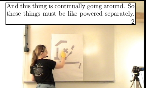
Figure 1: An excerpt of output generated by our keyframe selection system.